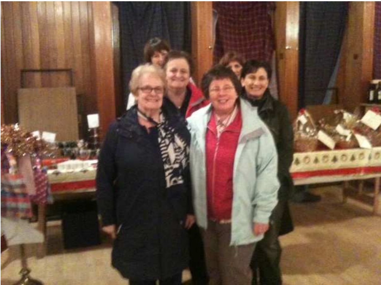
Some of the fete organisers—happy with their work!